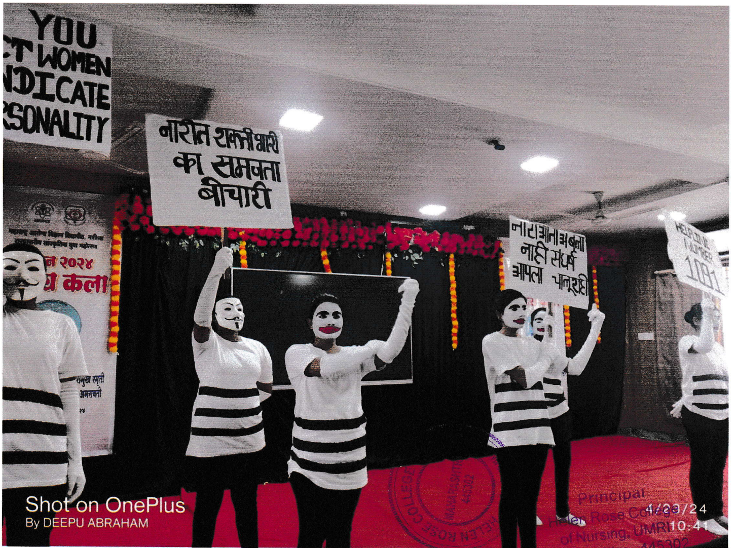
Shot on OnePlus By DEEPU ABRAHAM