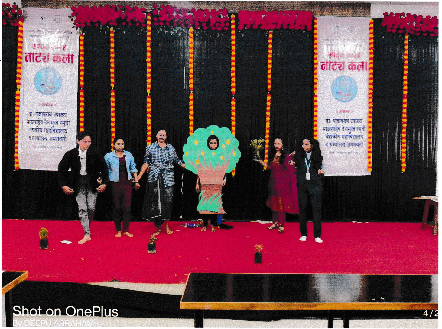
Shot on OnePlus By DEEPU ABRAHAM